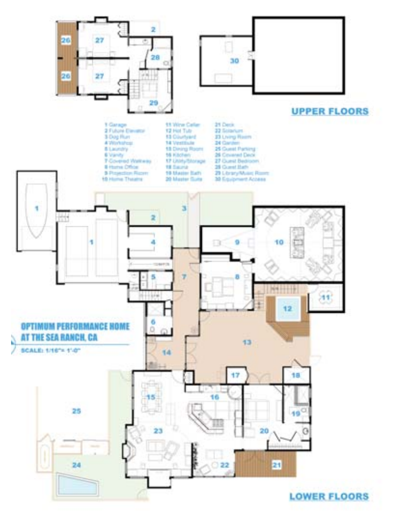
The floor plan of the Optimum Performance Home delineating the three-building compound arrangement and covered walk-WAYS

experience and not all aspects of our approach will apply to your project. Nonetheless, there will be aspects of our approach that will be educational and useful. I hope that, as a result, you will be rewarded with a better appreciation of the extent of commitment necessary to successfully design and build a new home.